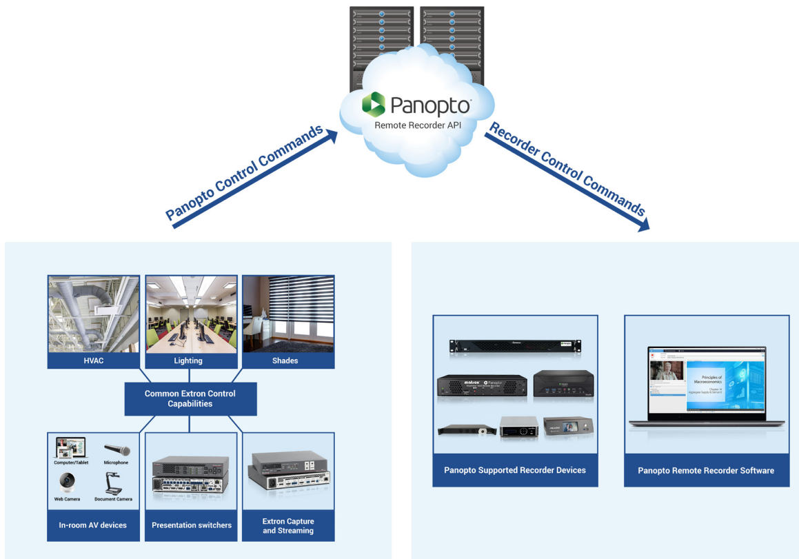
Figure 1. Typical Panopto Configuration