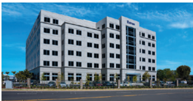
Extron USA West - Worldwide Headquarters

Extron 1025 E. Ball Road Anaheim, CA 92805