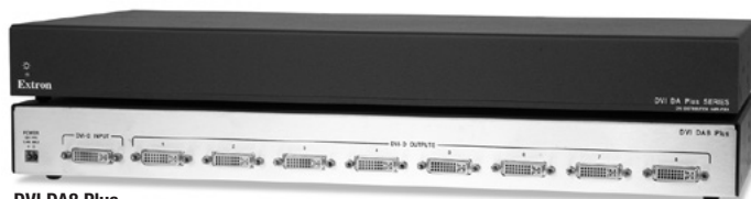
DVI DA8 Plus

The Extron DVI DA Plus are DVI distribution amplifiers with four, six, or eight outputs. Each product accepts a single link DVI signal from a source and distributes the signal to multiple attached devices. All DVI DA Plus models feature EDID Minder® and automatic input cable equalization. They are ideal for use in all applications that require reliable distribution of high resolution DVI digital video signals.