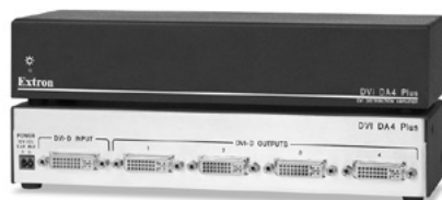
DVI DA4 Plus