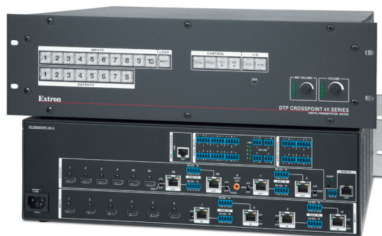
DTP CrossPoint 108 4K