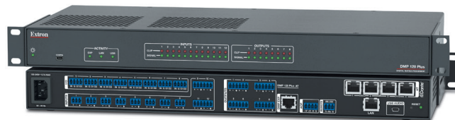
DMP 128 Plus AT