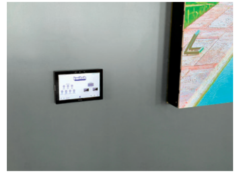
The 3x3 videowall can be controlled using the Extron TLP Pro 1025M 10" TouchLink® Pro touchpanel mounted on the wall.