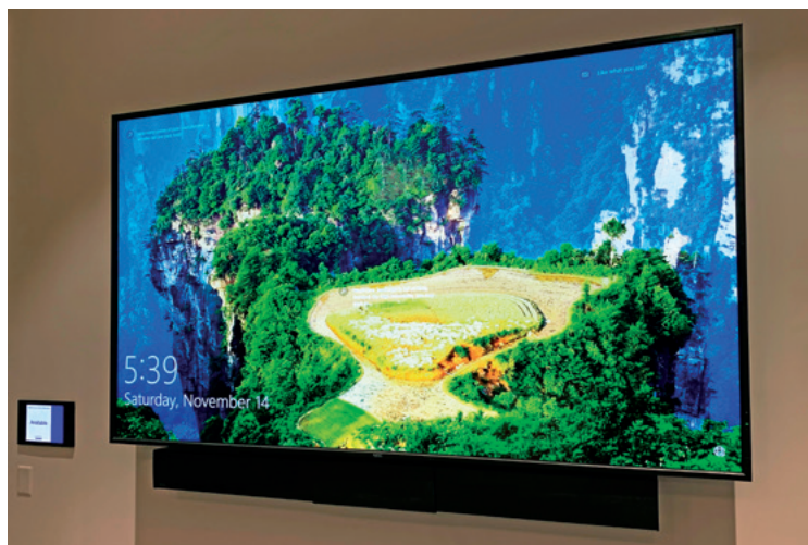
Twitch employees can select content from computers and other video sources to show on large wall-mounted flat panel displays.

installation of a DTP CrossPoint 86 4K IPCP MA 70 8x6 presentation matrix switcher and an Extron OCS 100C occupancy sensor, which is installed in the ceiling. It senses someone entering the meeting space and activates a series of automated functions, such as turning on the lights and powering up the display. Using both ultrasonic and passive infrared detection technologies, its integrated smart software continuously monitors the space and automatically adjusts timer settings and sensitivity. The OCS 100C system streamlines meeting setup and is maintenance-free for Twitch AV personnel.