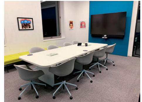
Conference rooms include an Extron OCS 100C occupancy sensor in the ceiling. It works with the control system, automating room functions such as turning on the lights and display when someone enters the room.

SF 26PT pendant speakers, and system control using Pro Series products. An Extron NAV® Pro AV over IP system facilitates overflow.