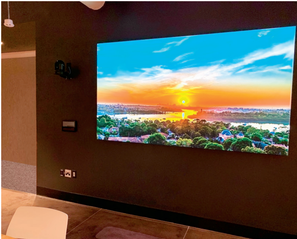
The 3x3 videowall in the All-Hands event space is supported by an Extron DTP CrossPoint 108 4K 10x8 presentation matrix switcher with built-in 4K scaling capabilities.