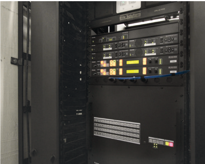
An equipment closet houses AV system central switching, scaling, streaming, and control equipment.

access points allow sharing of AV content from a variety of sources. Extron equipment performs AV switching, distribution, session recording, streaming, and control.