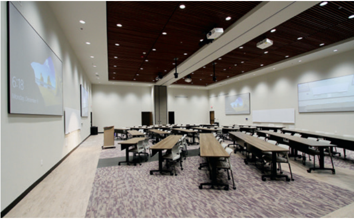
A partition wall can divide the Multipurpose Room into two classrooms, each able to use the AV system to display, store and live-stream multimedia content from a variety of sources.