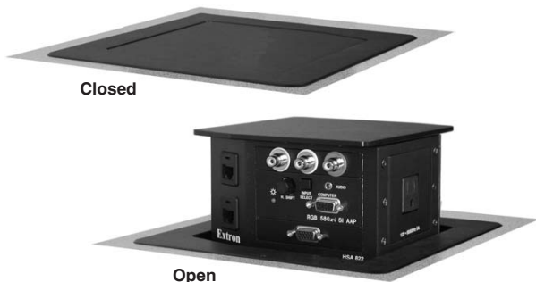
HSA 822M hideaway enclosure

The motorized action is controlled by a remote control or pressure on the top surface. Safety devices prevent injury and equipment damage.